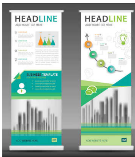
Figure 2. Sample of pull-up banners