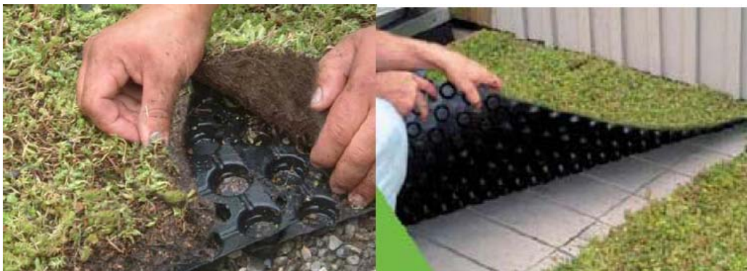
Figure 1. Vegetated mat system

The vegetated mat system is shown in Figure 1. They are normally pre-grown, then rolled up and transported as a complete system. It is a very light weight system with a thickness of about 45 mm (Doshi, et al. , 2005).