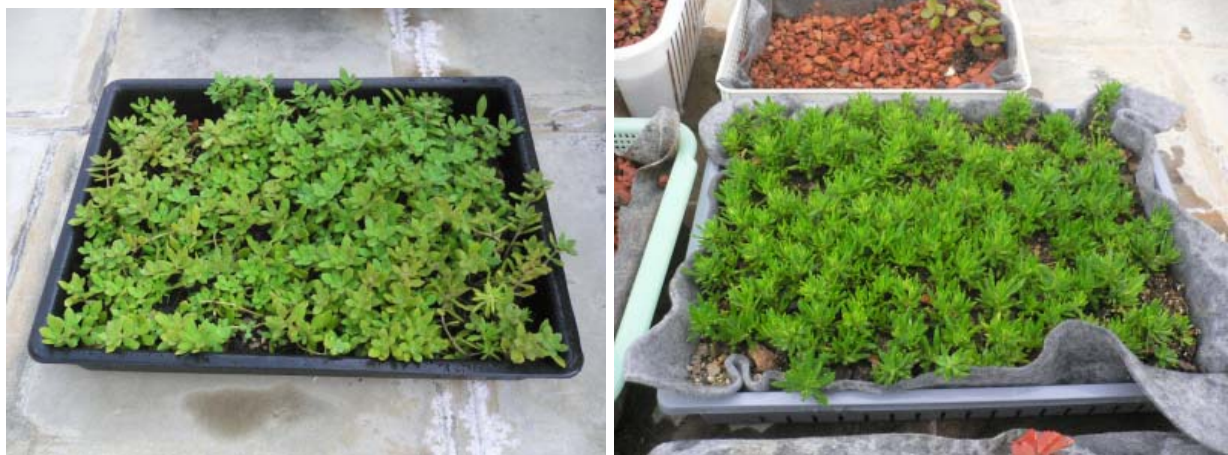
Figure 5. Test units of tray system for modular green roof

The selection of plants is crucial for green roof systems (ASTM, 2006). Since different plants have different characteristics, it is essential to identify the need for each plant and its function (Snodgrass and Snodgrass, 2006). For low maintenance extensive green roofs, it is more suitable to use hardy plants such as sedums that can adapt to the local climate.