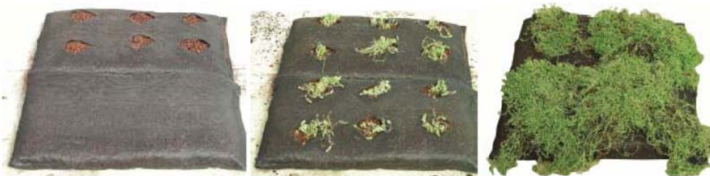
Figure 3. Sack system

Figure 3 shows one example of the sack system. Sack systems are flexible modules that can easily conform to irregular and radius areas. The growing media remains sealed within the fabric module until openings are made ready for planting after positioning them on the roof.