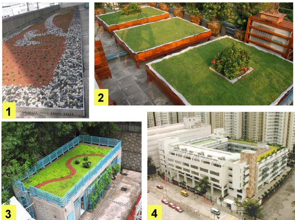
Figure 7. Green roof projects studied in Hong Kong (1: Government bldg.; 2: Site office B; 3: Primary school A; 4: Primary school B)