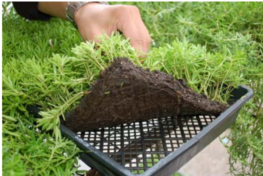
Figure 4. Prototype of a mat system for modular green roof

Mat and tray systems are chosen in this study since they can give the best solution to cope with weight and space limitations as well as offer high flexibility in adapting to different range of soil depth for different plants. Figure 4 shows a prototype of the mat system developed for our modular green roofs. Figure 5 indicates the test units of tray system prepared in our laboratory.