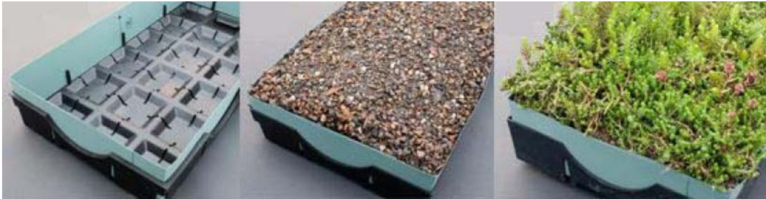
Figure 2. Tray system

Figure 2 shows an example of tray system. Nowadays, tray systems are the most commonly found modular green roofs in practice. Often, plastic interlocking containers are filled with a drainage system, growing medium, and vegetation prior to installation (Dunnett and Kingsbury, 2004). As the growing medium is completely contained in the tray, it can easily be removed or replaced without affecting the original structure or other plants.