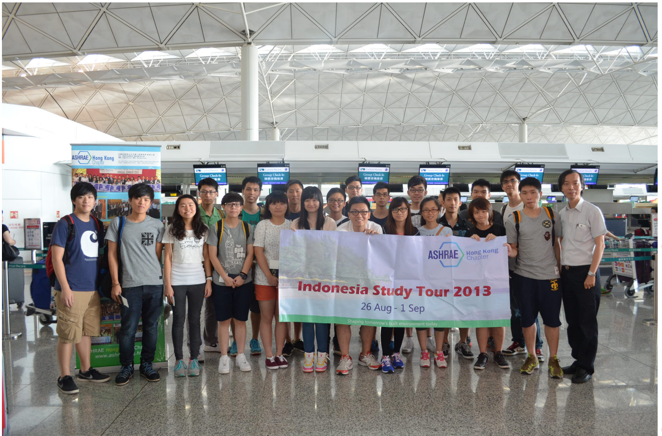
Day 1 Hong Kong International Airport