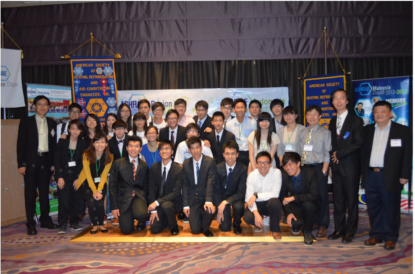
Day 5 CRC banquet dinner, HK Chapter and Taiwan Chapter