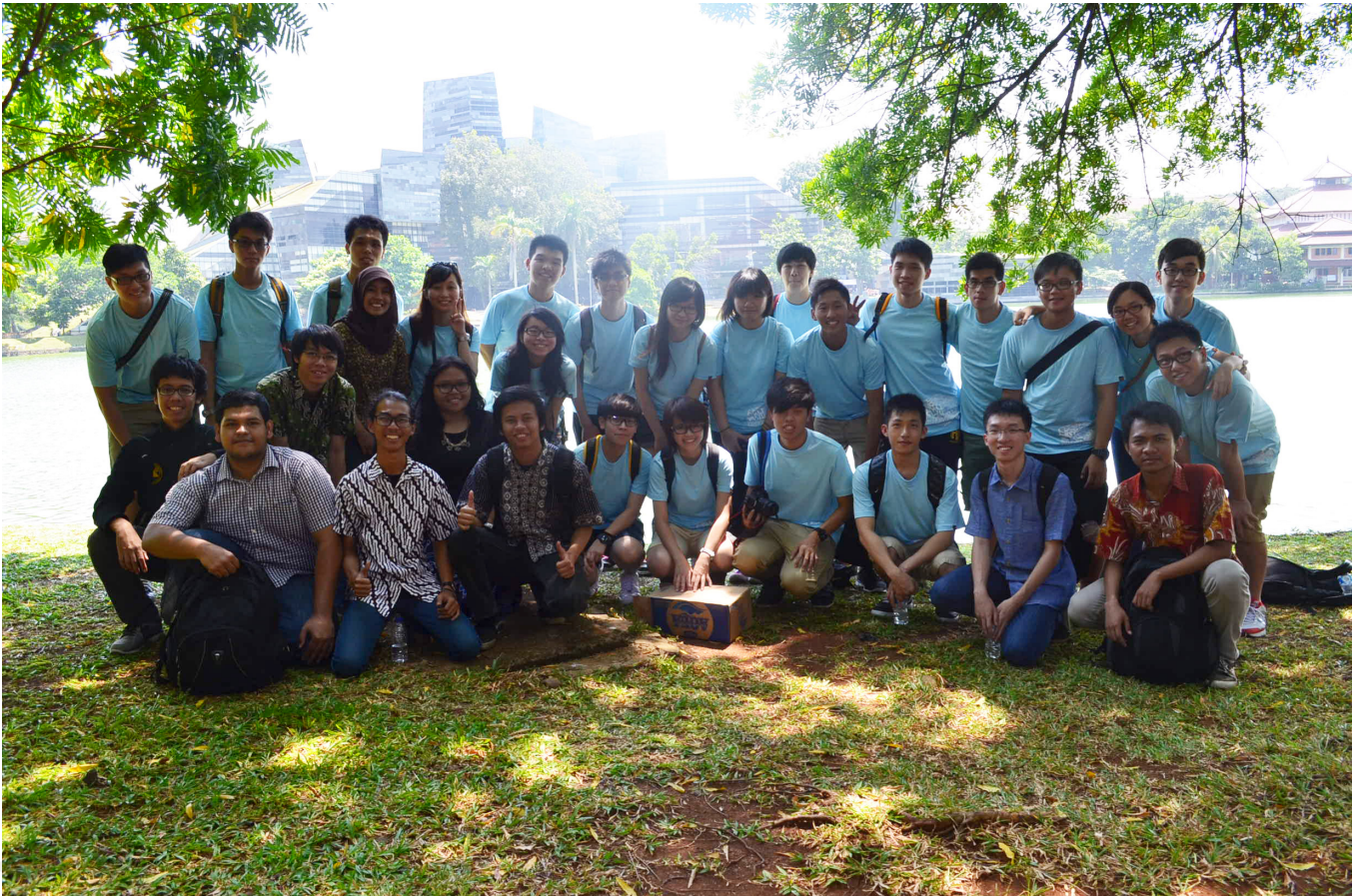
Day 2 University of Indonesia, with students from ASHRAE student branch