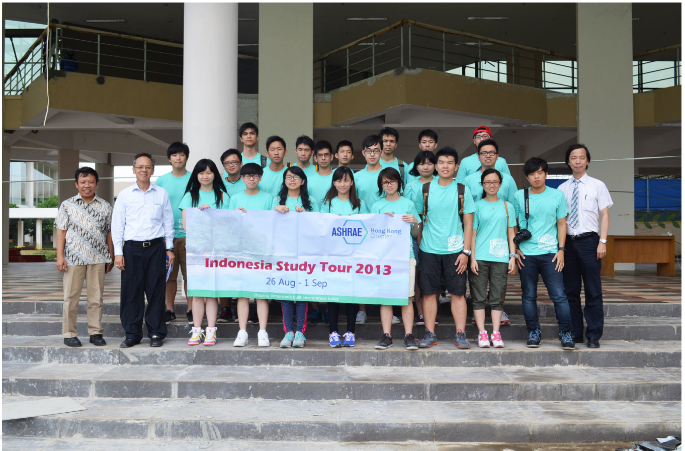
Day 4 Technical visit: Green Campus Project