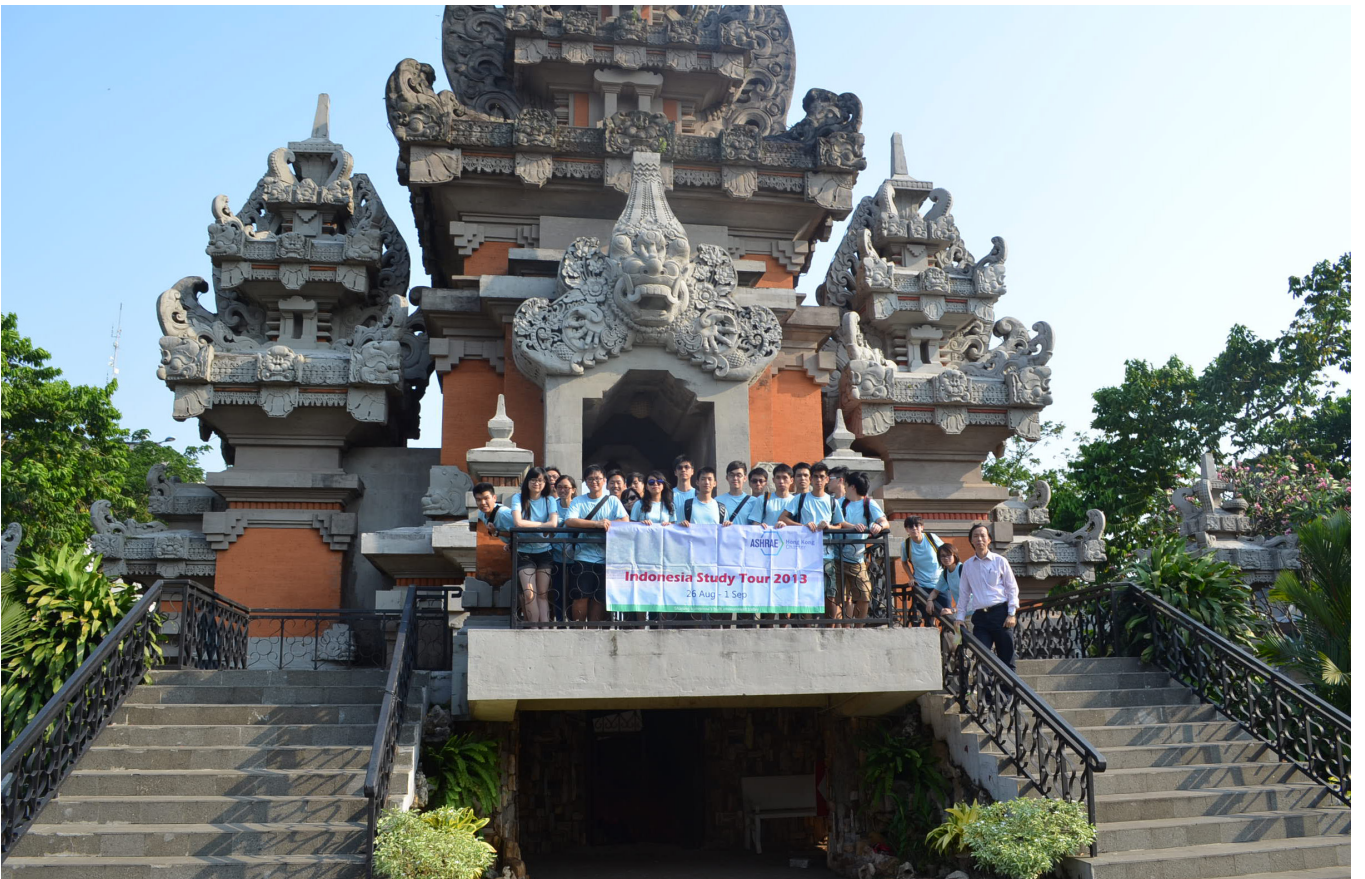
Day 2 Taman Mini Indonesia Indah (Indonesia Miniature Park)