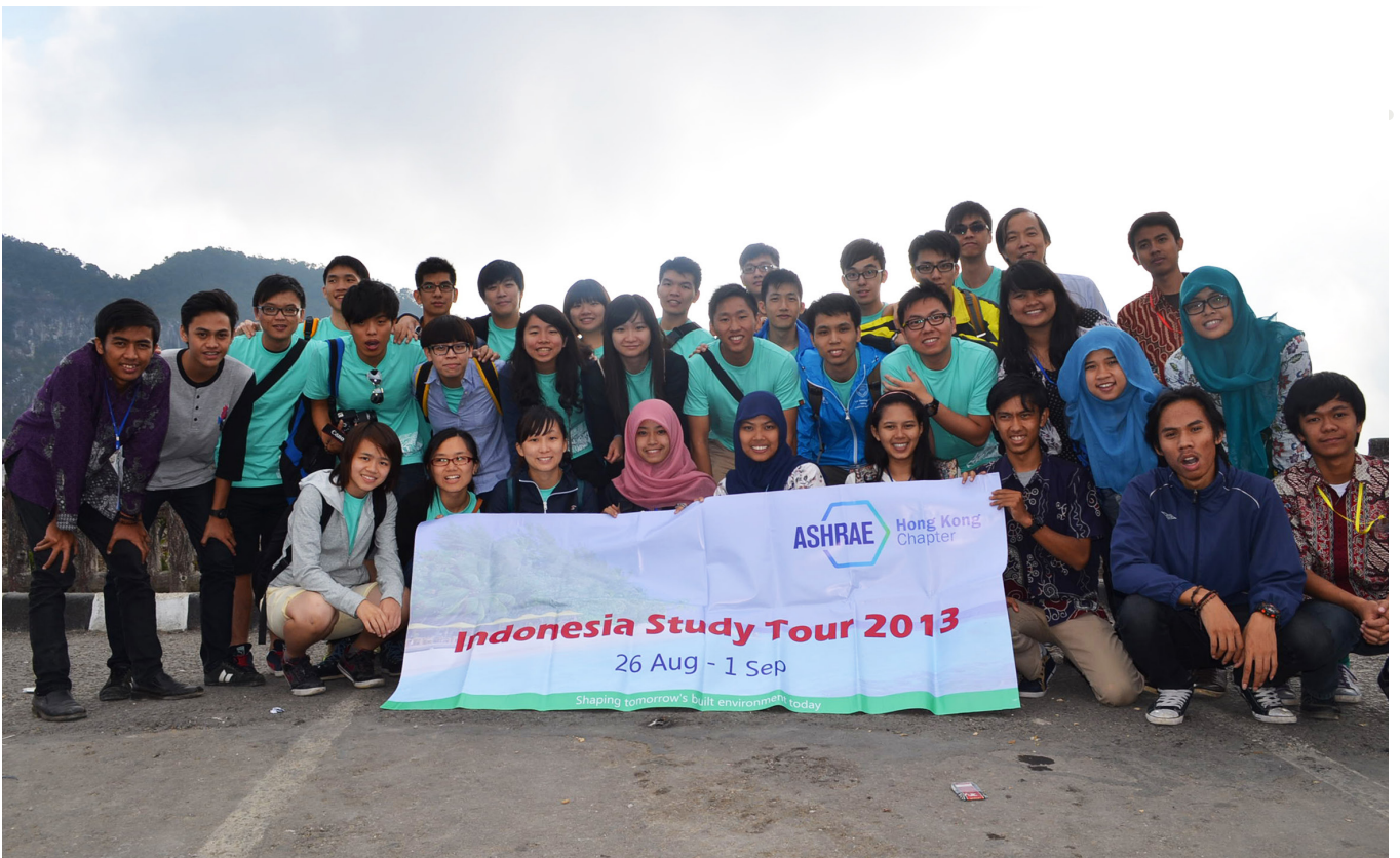
Day 3 Tangkuban Parahu Volcano, with ASHRAE POLBAN student branch