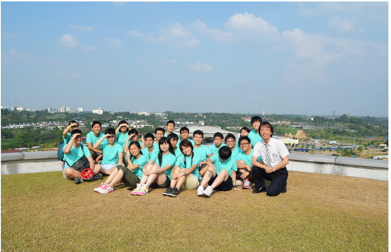
Day 4 Technical visit: Scientia Business Park