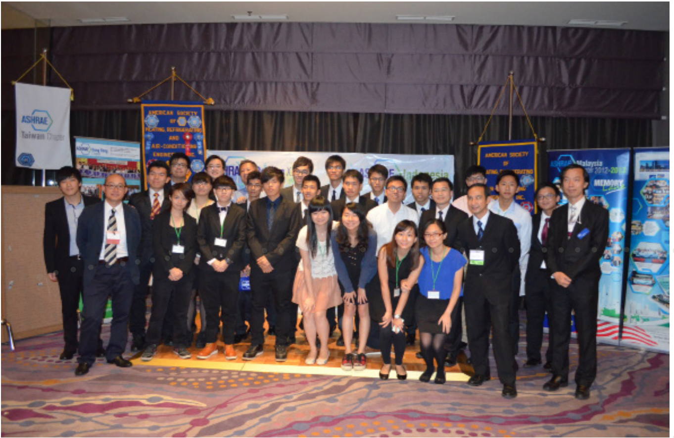
Day 5 CRC banquet dinner, HK Chapter