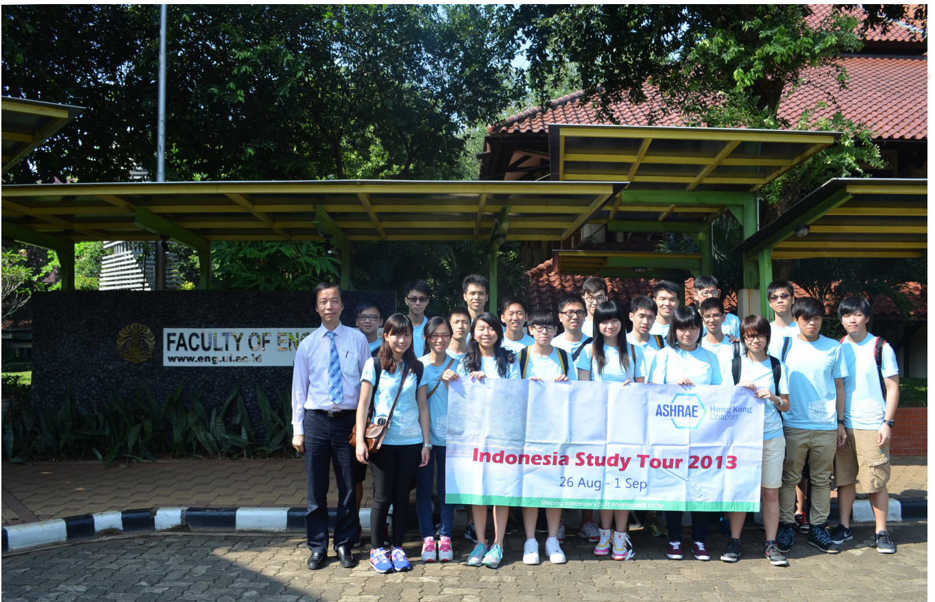
Day 2 University of Indonesia, Faculty of Engineering