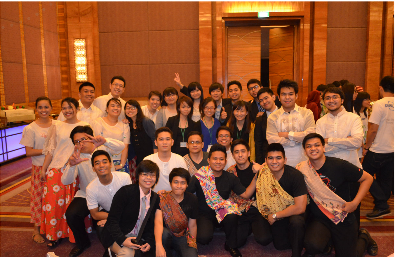
Day 5 CRC banquet dinner, HK Chapter and Philippine Chapter