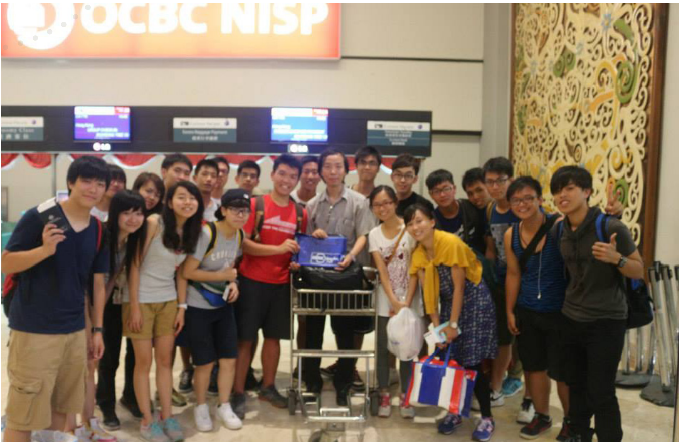
Day 6 Soekarno–Hatta International Airport, Jakarta, Indonesia