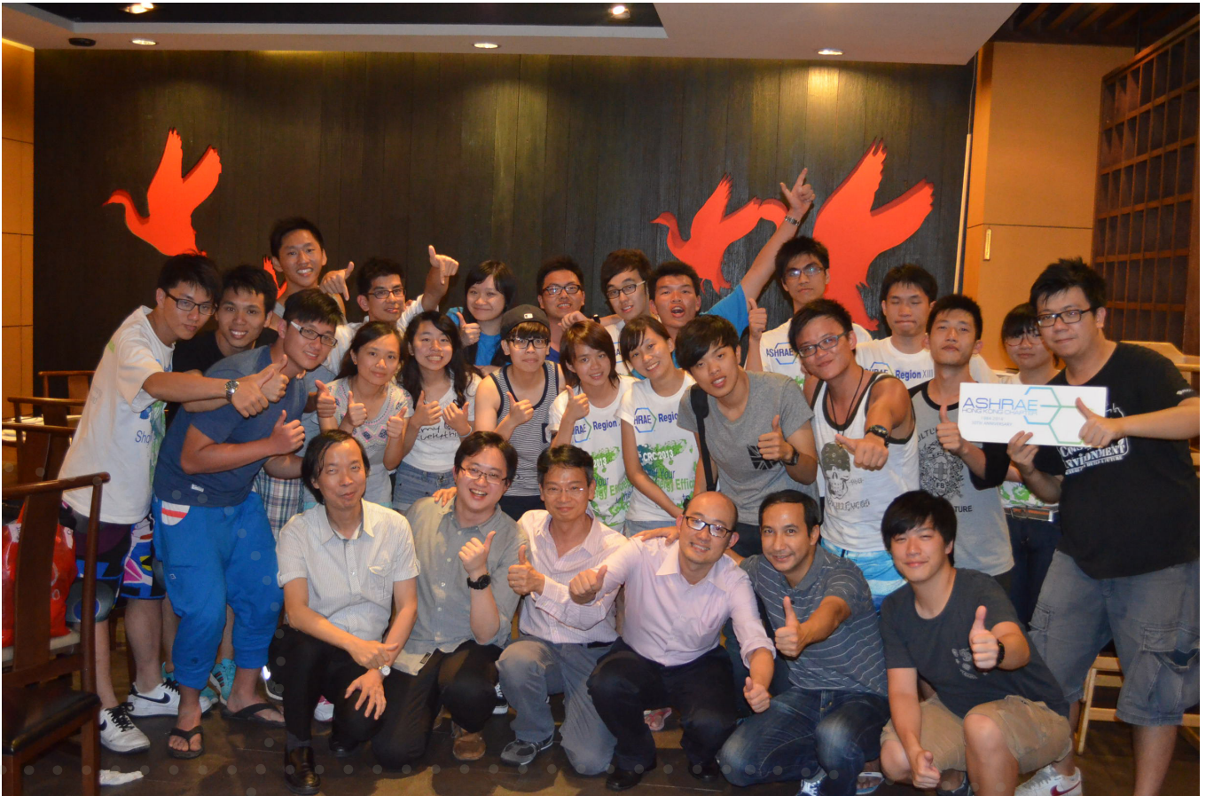
Day 6 Celebration dinner, HK Chapter