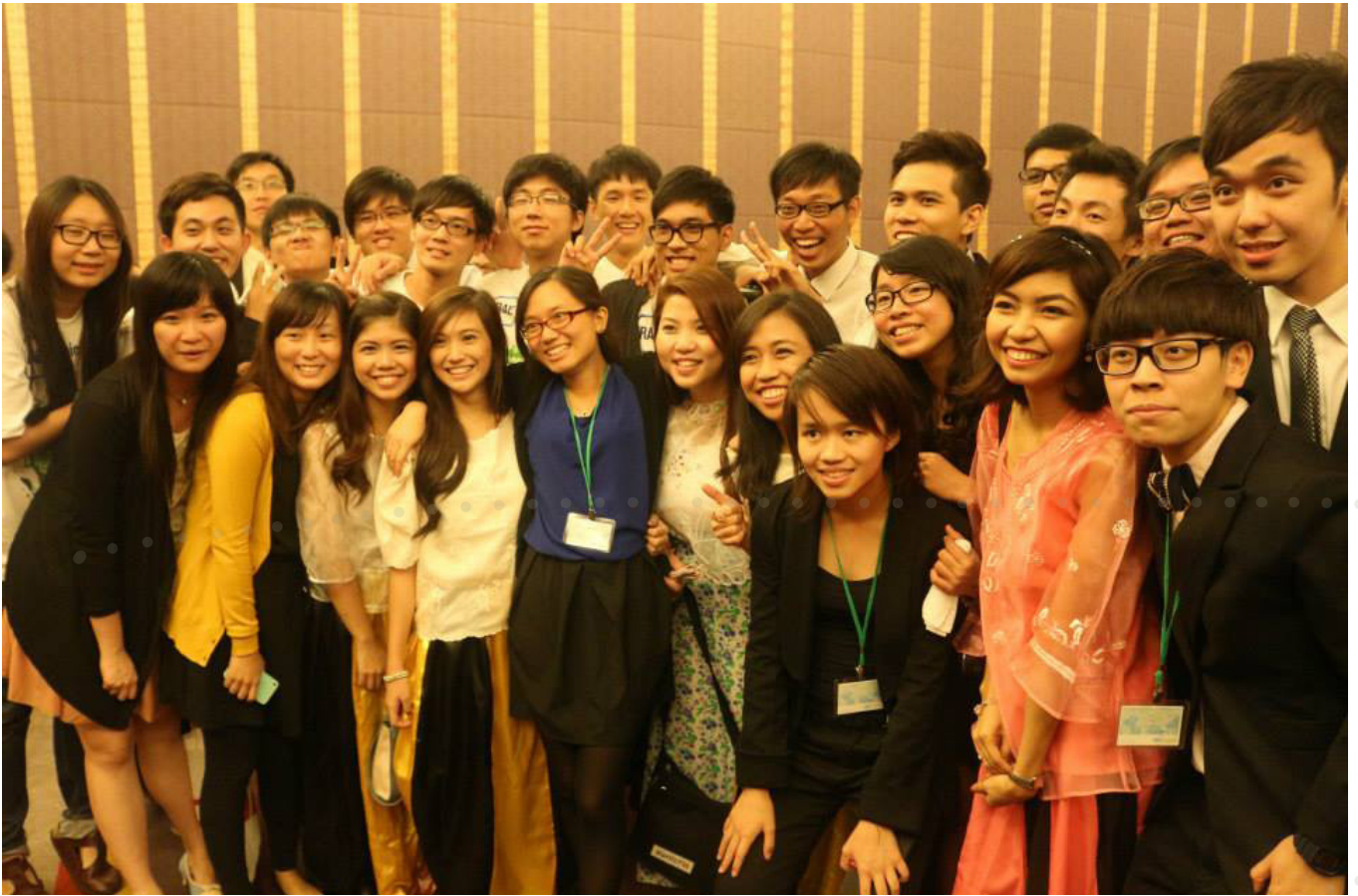
Day 5 CRC banquet dinner, HK Chapter, Malaysia Chapter and Philippine Chapter