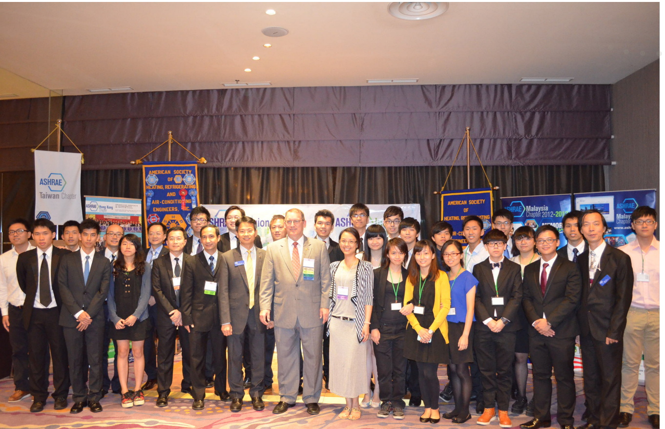
Day 5 CRC banquet dinner, HK Chapter and ASHRAE president