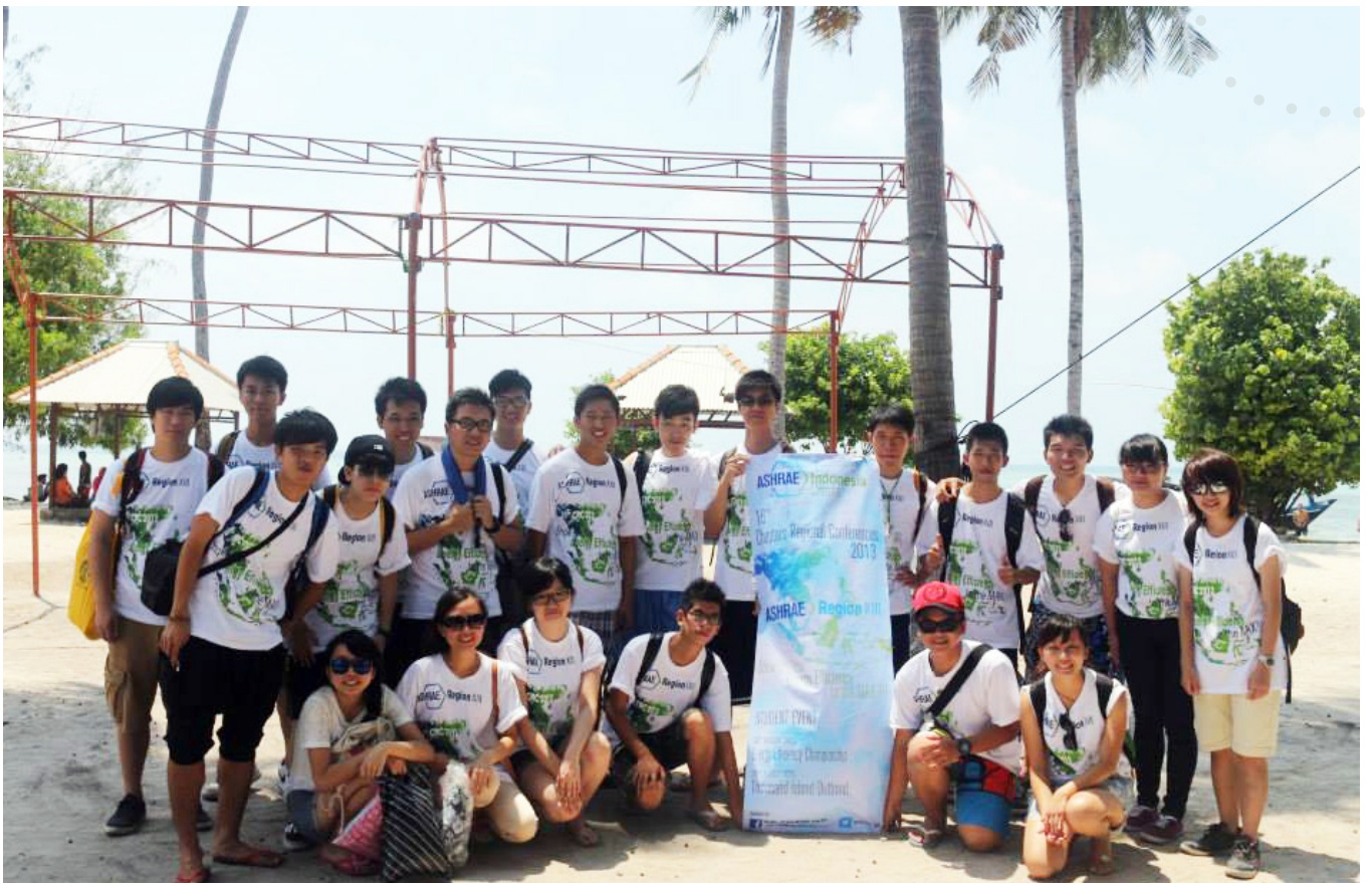
Day 6 Thousand Islands