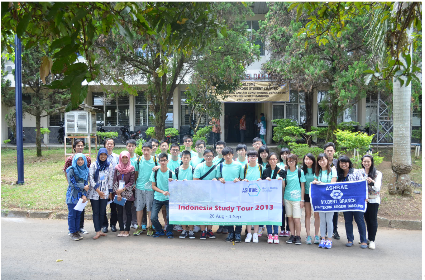
Day 3 Politeknik Negeri Bandung (POLBAN), with ASHRAE POLBAN student branch