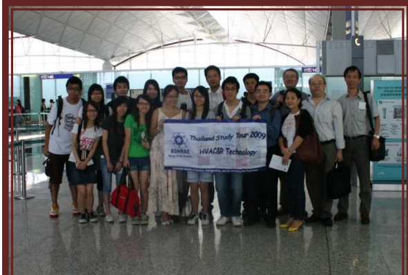
Say Bye to HK