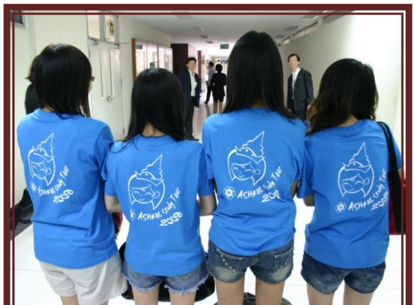
Beautiful Design !