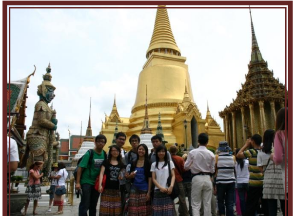
~ Giant Palace ~