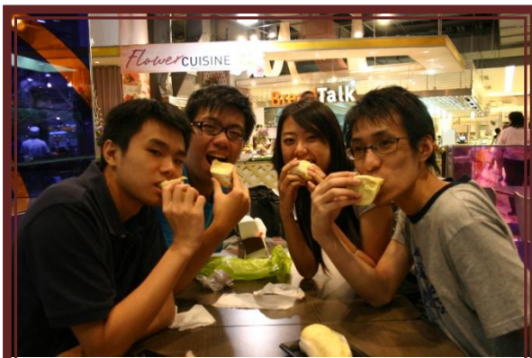
We LOVE Durian !!