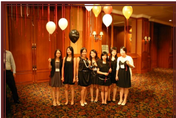
~ Our lovely Girls ~