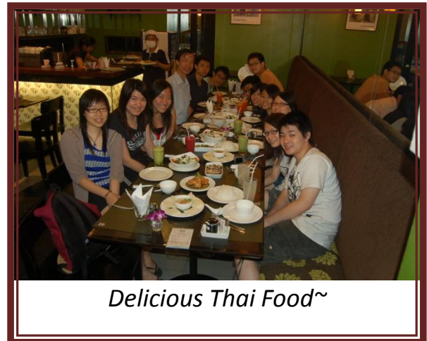
Delicious Thai Food~