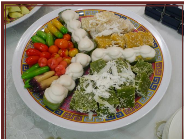
Traditional Thai Dessert