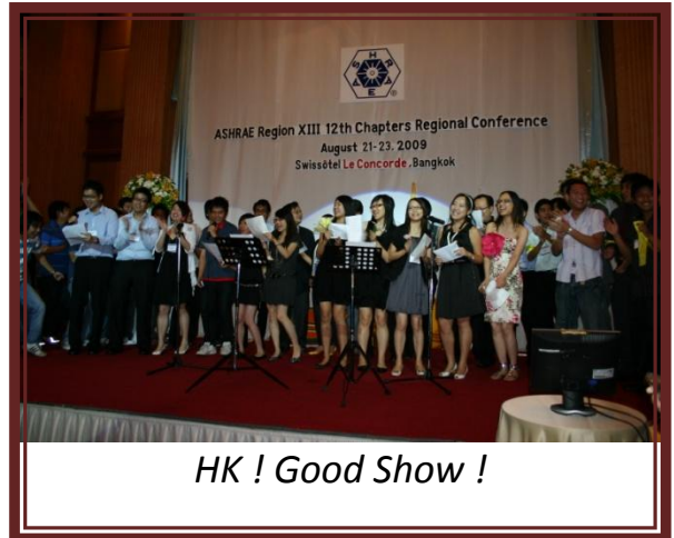
HK ! Good Show !